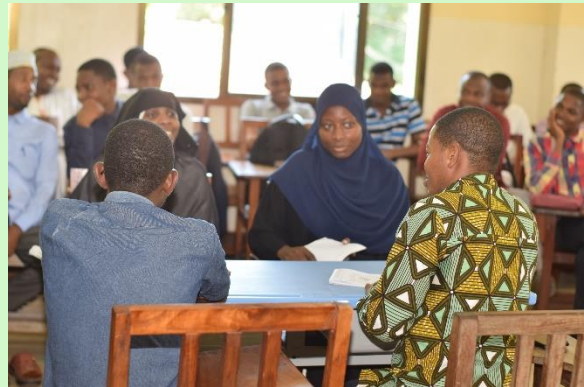
Role-Play 1: Responsible Leader (Head Master)