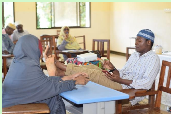
Role-Play 2: Irresponsible Leader (Head Master)

After the training, the students had the opportunity to demonstrate to audience the responsible and irresponsible school leader role play. The role play had one scenario whereby the Head Master is at the meeting with staff. A good Head Master showed the important skills a leader should possess while on the other side the role play exposed the poor leadership skilled Head Master who treated poorly the staff as a result, the school experience poor performance.